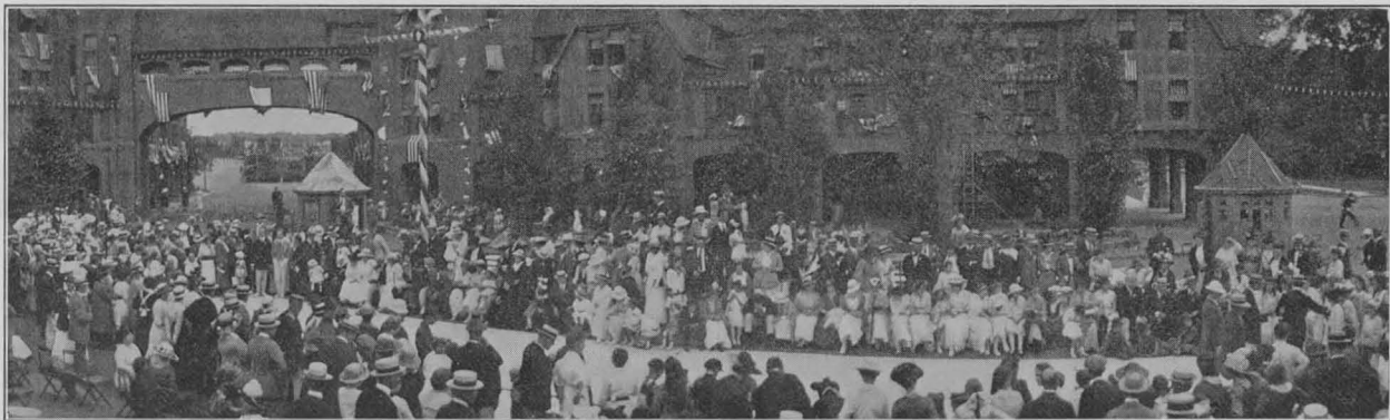
CHILDREN'S GAMES IN STATION SQUARE JULY 4th, 1915

The songs to be sung are "America," "Columbia, the Gem of the Ocean" and "Star Spangled Banner." It is most advisable that all of us be familiar with the words and music of these songs.