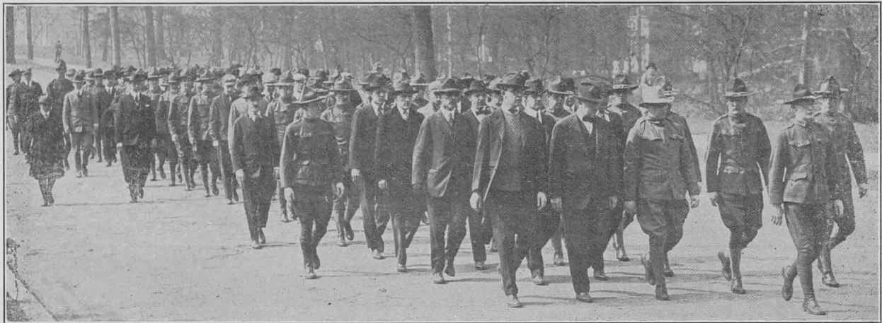
SECOND DRILL OF THE FOREST HILLS RIFLE CLUB.