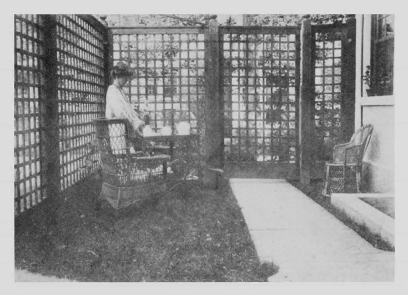
A GARDEN CORNER

Because it offered us so many amusing and substantial things —a well built house, intelligently planned; an enchanting garden and dogwood trees all our own; satisfying neighbors, a restful absence of hideous placards and fly-specked shops, a comfortable permanence—all these things. And these make excuse for great pride of ownership. What more could one wish? RUBY ROSS GOODNOW