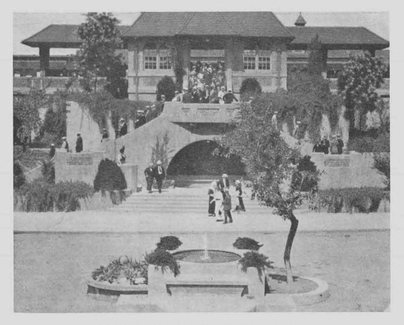
STATION AT FOREST HILLS GARDENS

The station is constructed of brick and concrete with tile roof and cost $50,000, of which the Railroad paid $10,000, the Development Companies paying the balance.