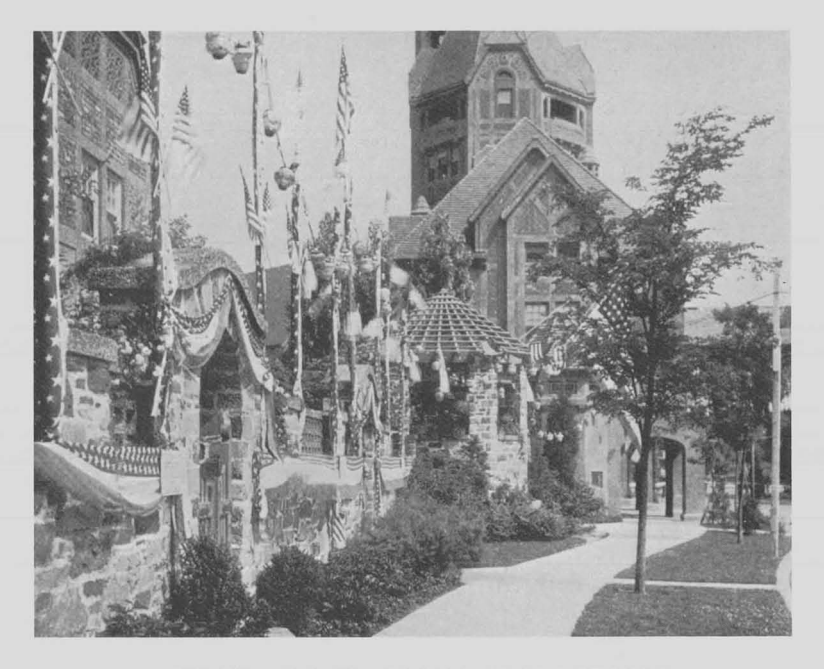
GREENWAY TERRACE ON THE 4TH OF JULY

Why? Because you can build an attractive house without a pseudo-Swiss chalet-bungalow on one side of you, while a retired bar-keep on the other side puts up a Swedish-Renaissance cottage with a Greco-Roman pergola and a catch-as catch-can roof. Because you can get out from town in time to play several sets of tennis at the largest and best Club in the country, and still get home in time for dinner. Because you do not need to have aHarlem dinner (i.e. stop at the salad course) every time you go to the theater. Because they don't make a road and then tear it up to lay pipes. It is planned right, built from the bottom up. Because they don't have a $50,000 sales office and a 10 cent development. And one look at that Fourth of July celebration last year would have brought me out to stay. And fifteen minutes to the Pennsylvania Station!