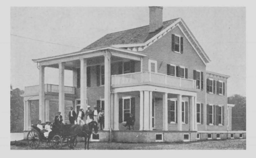
THE GARDENS CLUB

Why did I come to Forest Hills? Because it is one great garden of artistic uniformity with the people, the homes, the flowers and the song birds and the artist realizes his ideal dwelling place.