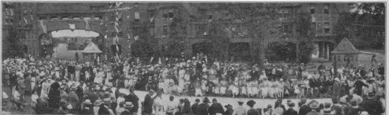
CHILDREN'S GAMES IN STATION SQUARE JULY 4th, 1915

The songs to be sung are "America," "Columbia, the Gem of the Ocean" and "Star Spangled Banner." It is most advisable that all of us be familiar with the words and music of these songs.