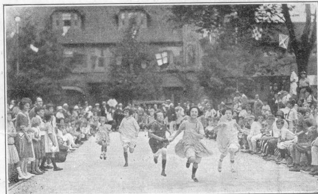
CHILDREN'S GAMES, STATION SQUARE, JULY 4, 1923