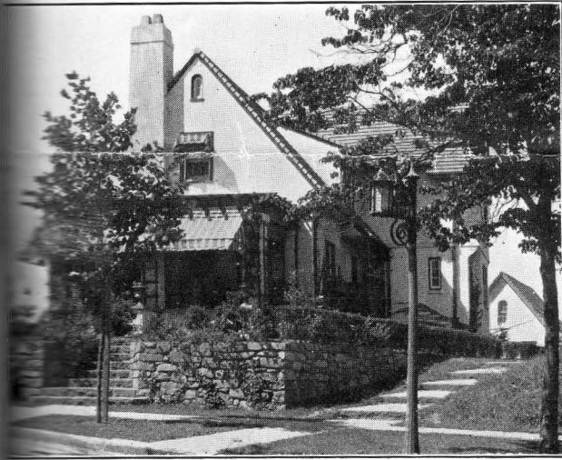
HOME OF E. H. VAN NAME.

Pictured above is the home of E. H. Van Name on Wendover Road. The design is individual, yet in certain respects leans towards the English farm house type. The lines are brought out without applied ornament, depending upon the well studied arrangement of plan, the rough texture of the stucco and the deep red tones of the tile roof. The dining porch is attached to the rear, commanding a fine view of the Gardens and the neighboring farms.