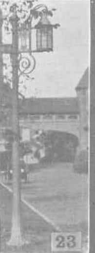
(1) Martin house designated by Grosvenor and Company, erected in Greenway Terraces by the Company. See figure No. 12. (2) Do not treat the unsightly telegraph pole in your rear yard like this: a weather-vane and an attractive nesting box. (3) Types of nesting boxes and feeding devices made, and sold by the Journeyman.