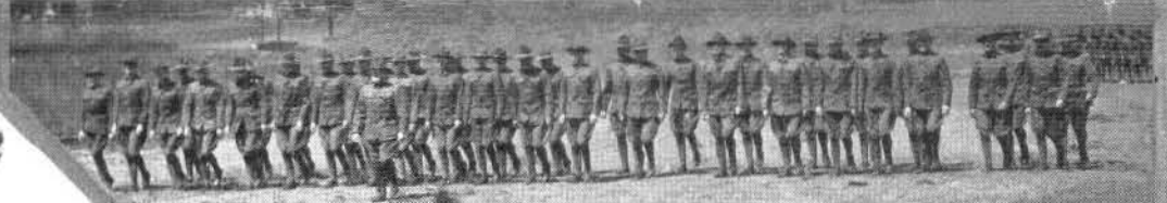
- FOREST HILLS RIFLE CLUB -