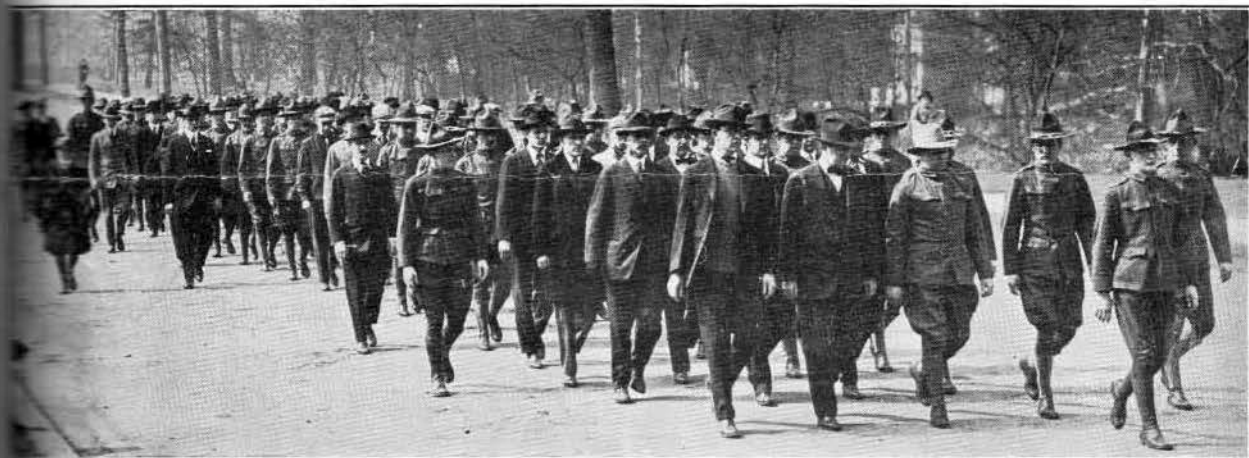
FOREST HILLS MILITARY COMPANY.