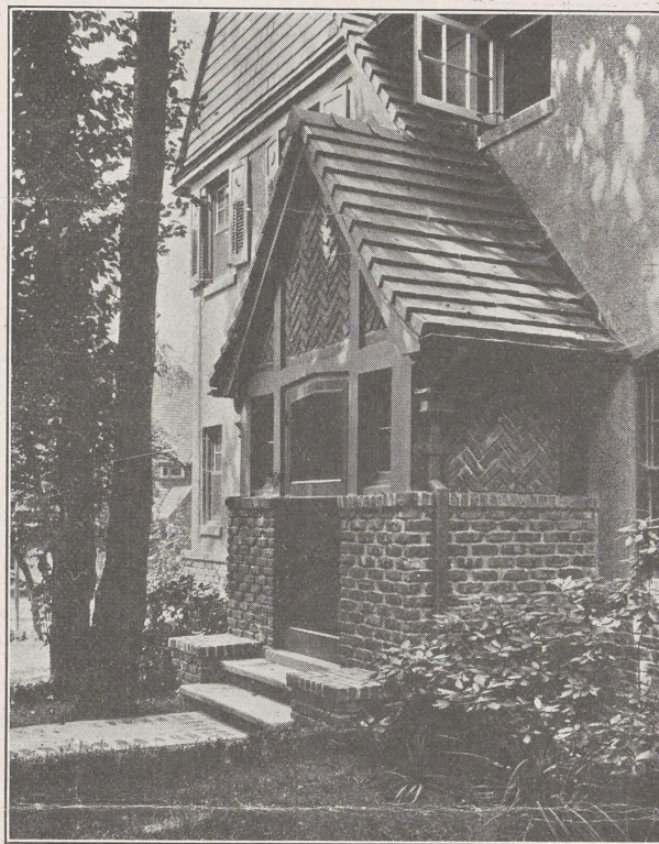
ENTRANCE DOORWAY AND VESTIBULE

The local library is very much in need of more shelf space. Will some one kindly donate a discarded book case? If there is one to be offered, please call