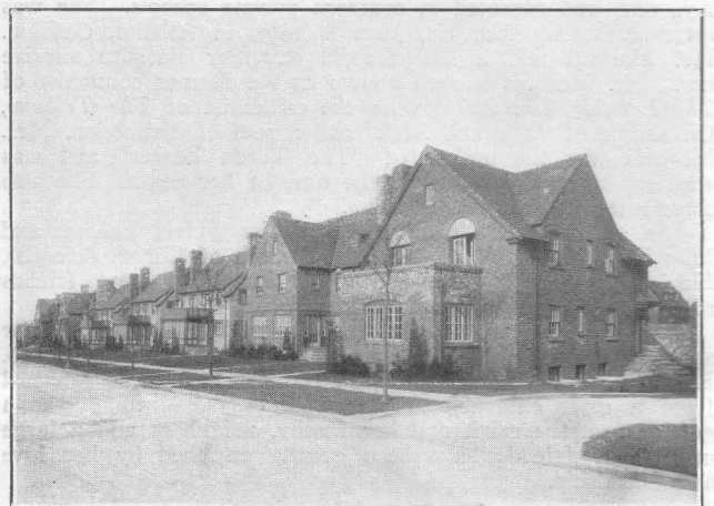
A VIEW OF WHITSON STREET

The new group of 12 houses on the south side of Whitson Street is rapidly approaching completion and sales are now being made for January occupancy. This group is practically a duplicate of the first group, but the end detached houses have ten rooms and four baths with double garages and Baker automatic oil burners. The other