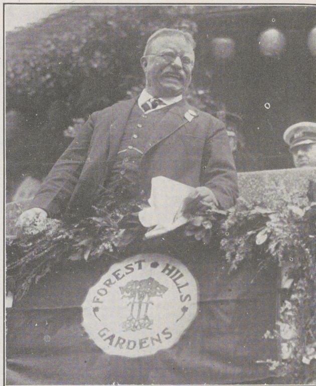
COL. ROOSEVELT ACKNOWLEDGING THE APPLAUSE OF THE CROWD IN STATION SQUARE