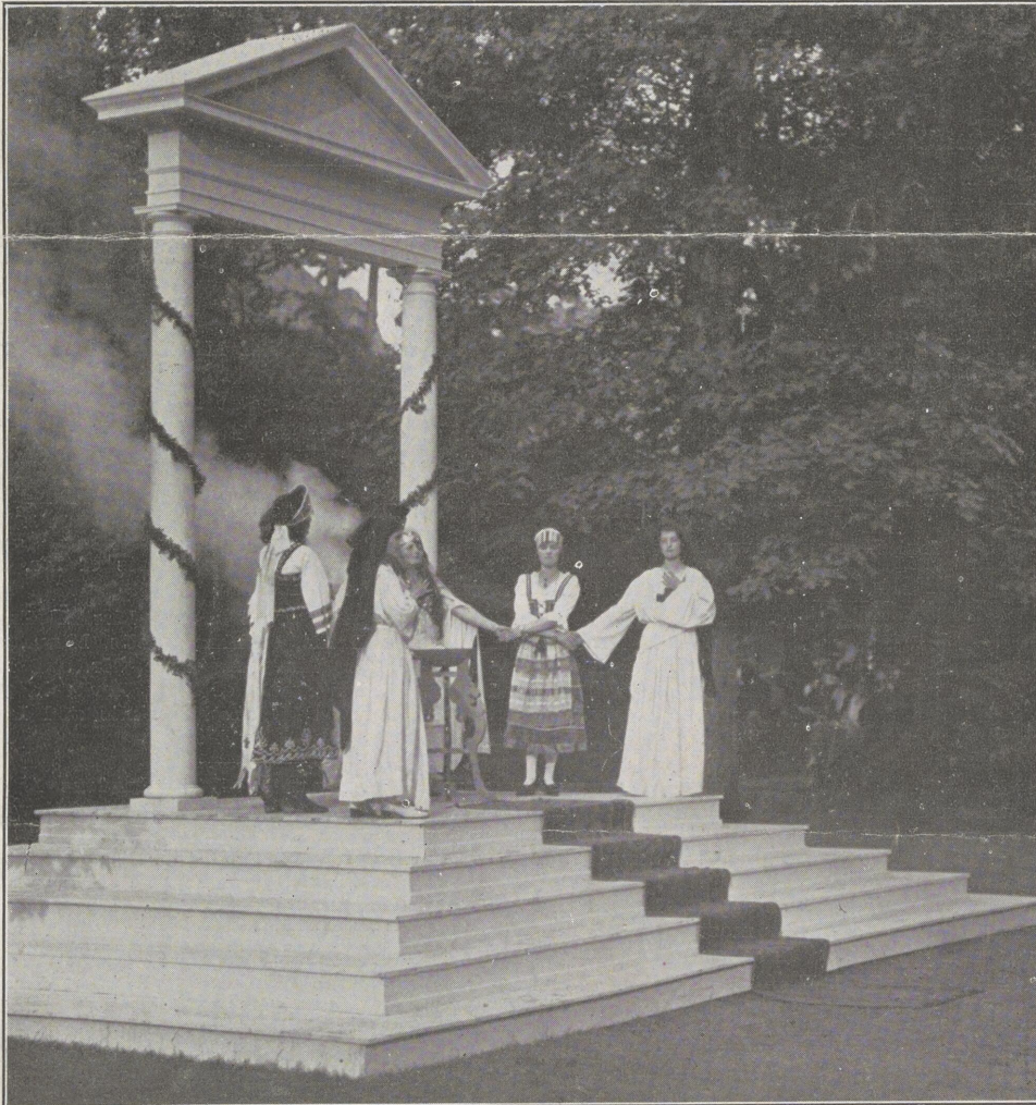
SCENE FROM A MASQUE OF LIBERTY IN OLIVIA PARK.