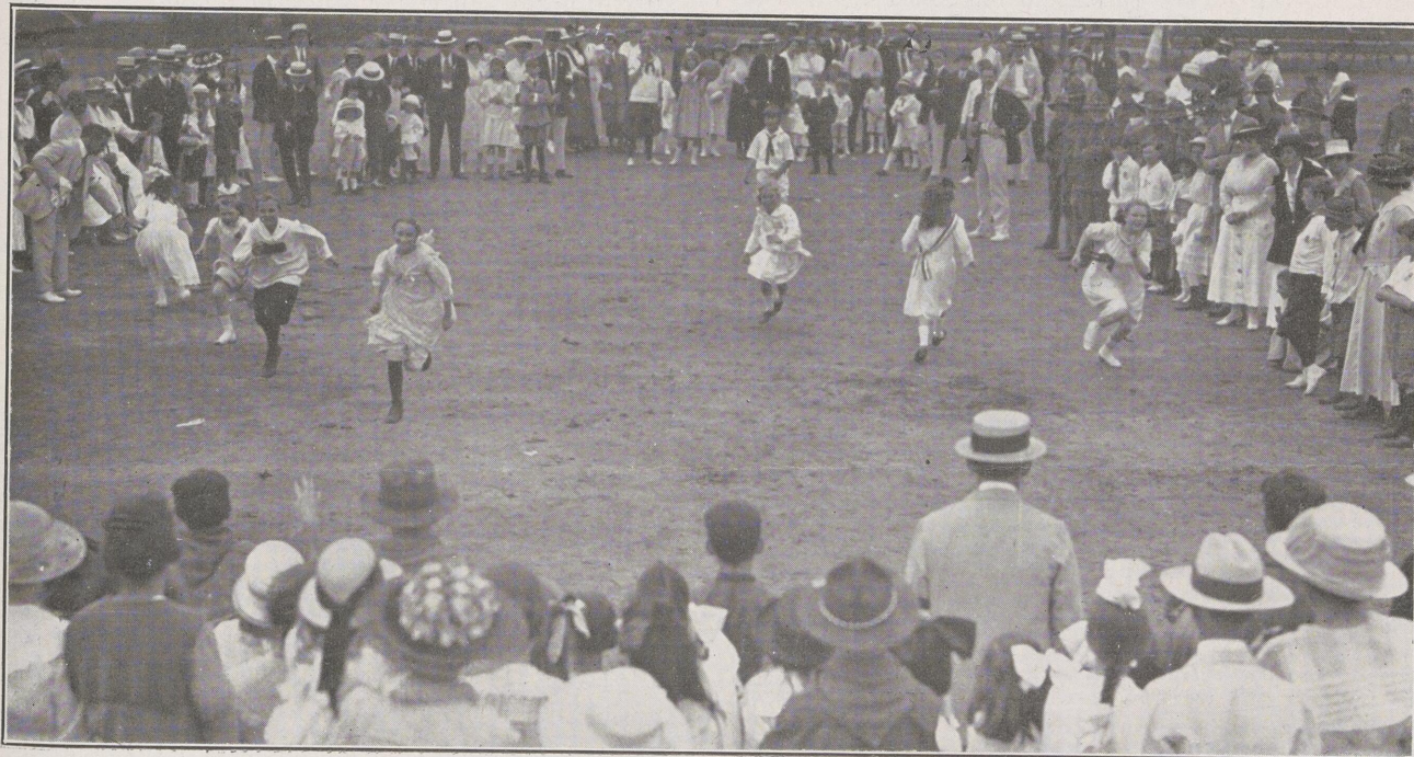
CHILDREN'S GAMES AT THE PLAYGROUND