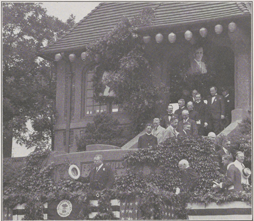
COLONEL ROOSEVELT AND HIS RECEPTION COMMITTEE

The question of the continuance of the Rifle Club as a separate organization will be decided as soon as possible.