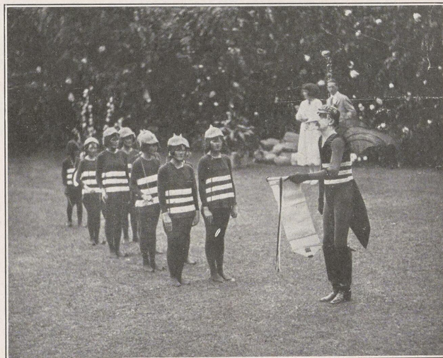
THE BIG AND LITTLE MOSQUITOES IN "THE FLYING DOOR MAT"