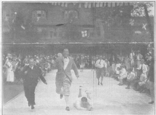
FINISH (IN MORE WAYS THAN ONE) OF THE FAT MAN'S RACE, STATION SQUARE, JULY 4