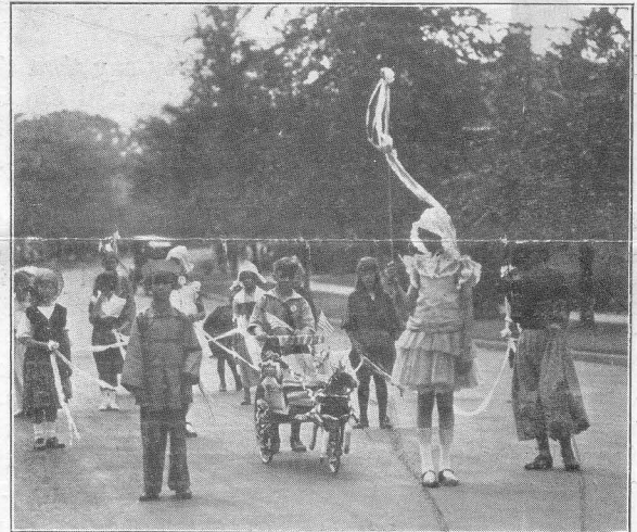
CHILDREN OF MANY NATIONS A Picturesque Feature of the Gardens July 4 Parade—1922.

All of the children will be interested in the sports which have been arranged for them and which will take place at