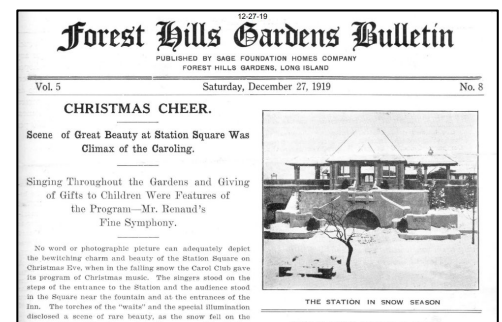
The Gardens Bulletin, 1919

Visit us online at: www.foresthillsgardensfoundation.org