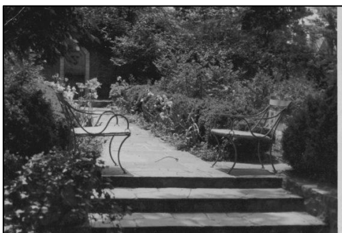
Tea Garden Behind The Inn